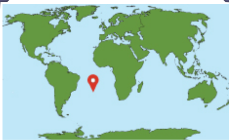
The Atlantic Ocean